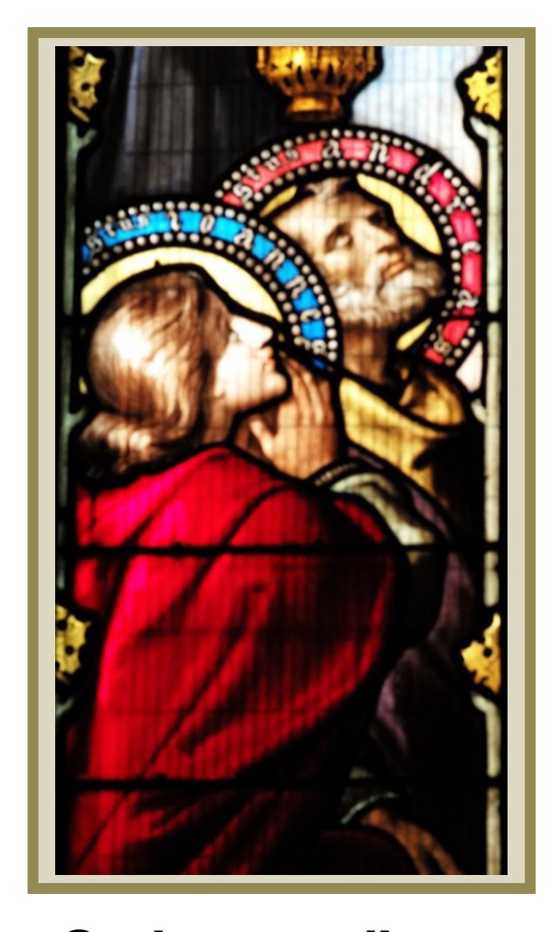
St. Leonard's Warmingham

"May the God of hope fill you with all joy and peace as you trust in him, so that you may overflow with hope by the power of the Holy Spirit."