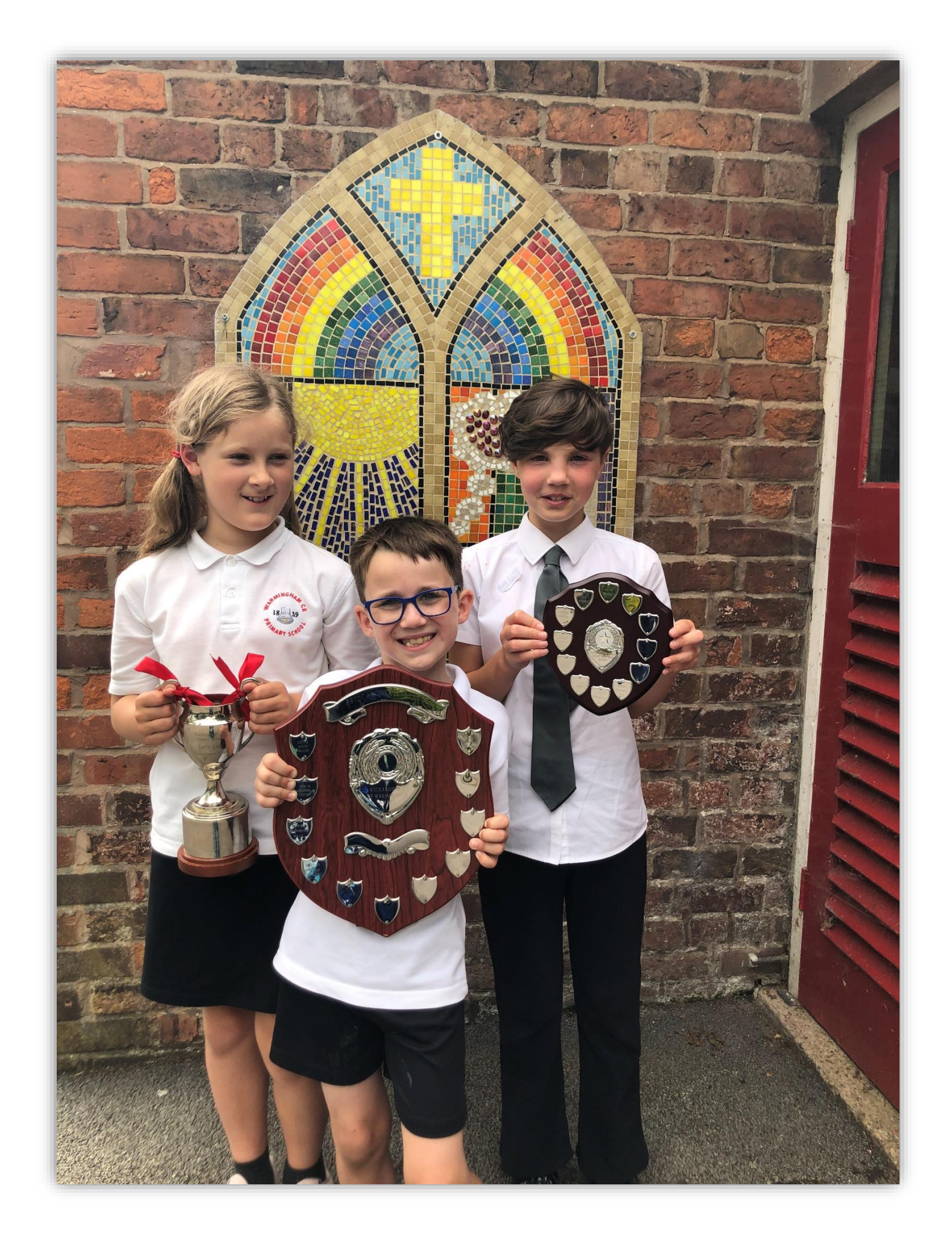
www.warming hamce.che shire.sch.uk