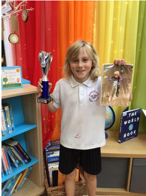
Morrison came an impressive 26 th out of the whole country – well done Morrison!