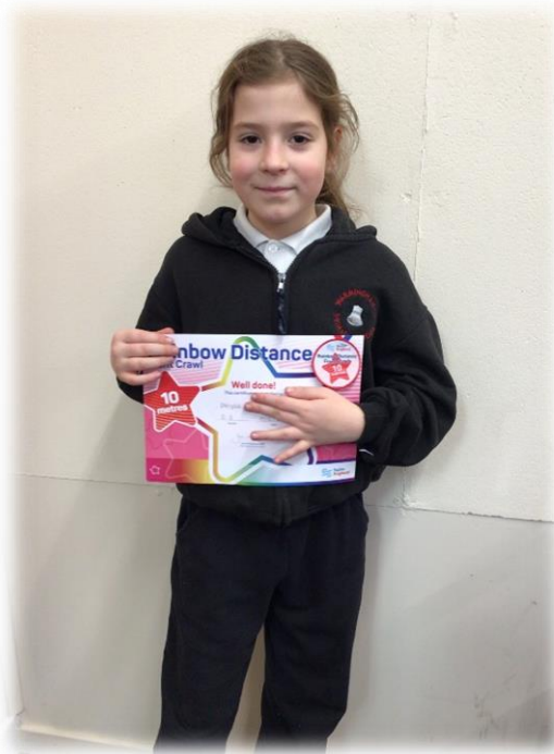
Pati achieved her 10 metre swimming badge – well done