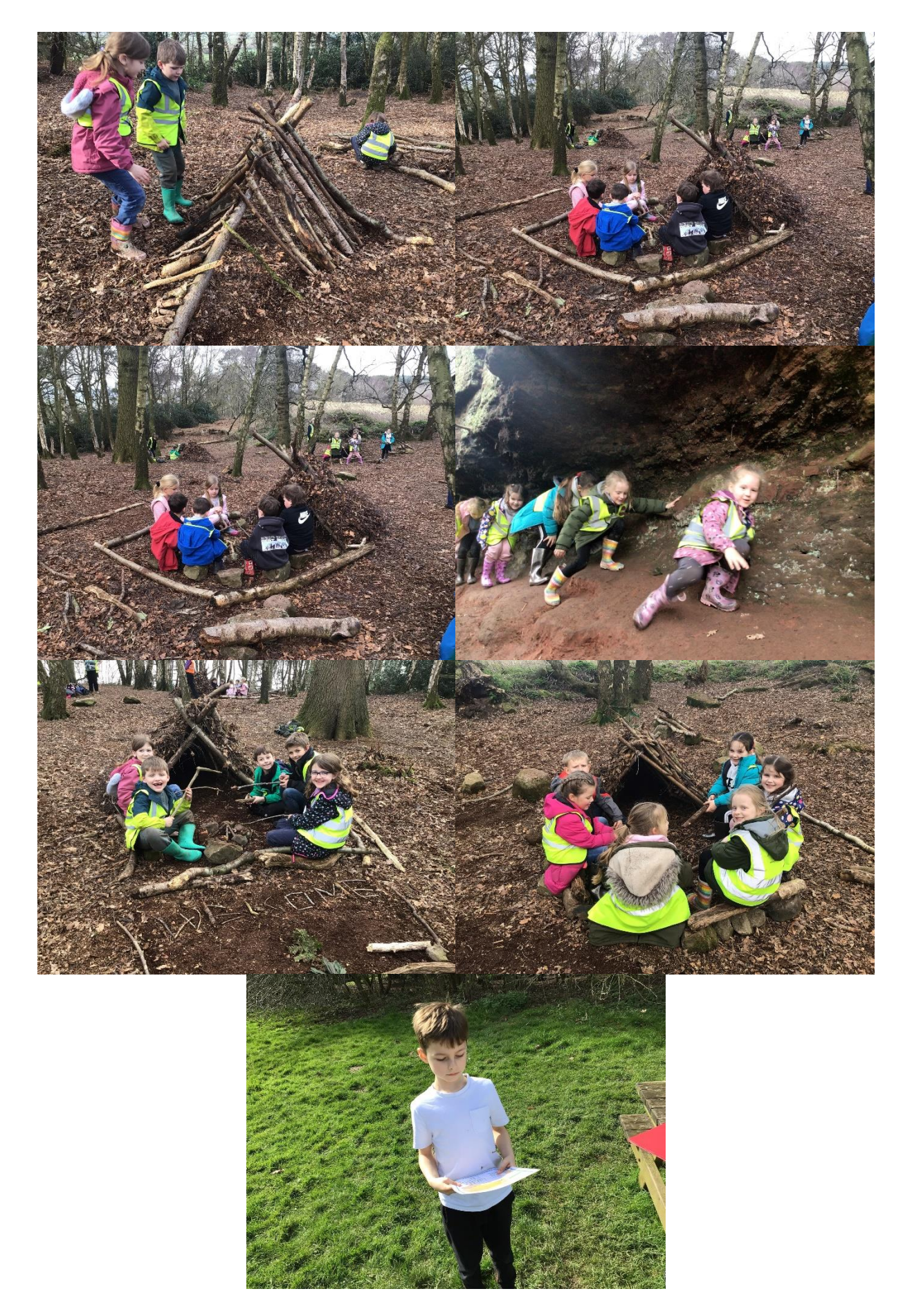
We would like to thank the 'Up and Under Foundation' for the support they have provided to some of our families. Please visit our Facebook page and the school's website to see more photographs of the residential.