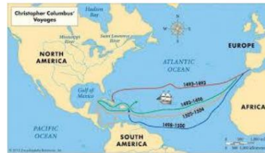
Christopher Columbus' Voyages