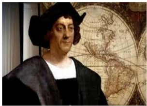
Christopher Columbus 1451-1506