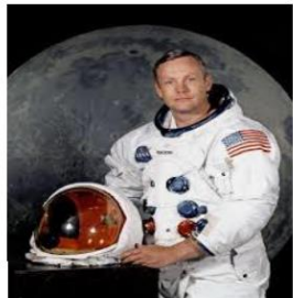
Neil Armstrong 1930-2012