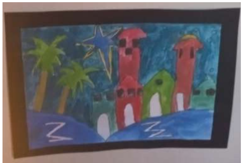
Warmingham School paintings of Little Town of Bethlehem on display in St Leonard's Church.