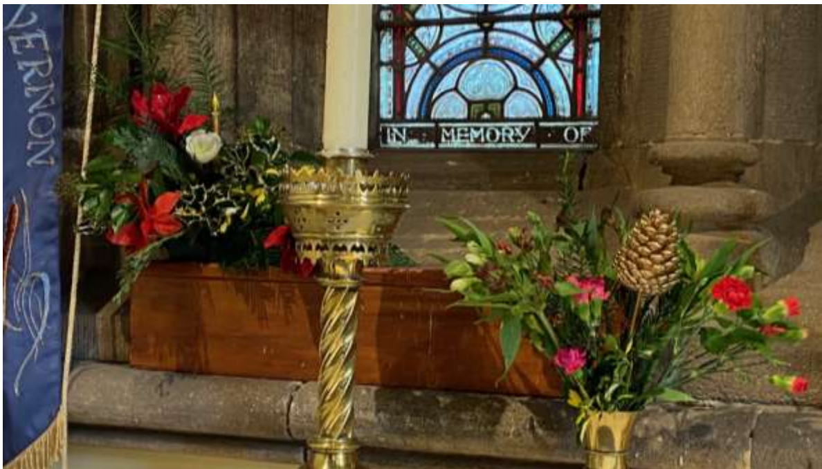
Christmas arrangements at St Peter's