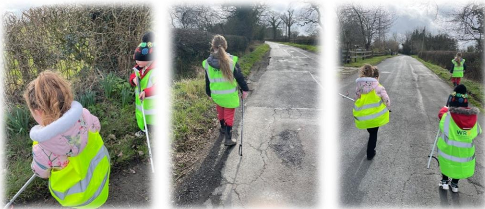
Some of our children and a few perspective children joined in last weekend's litter pick around the village. Well done everyone.